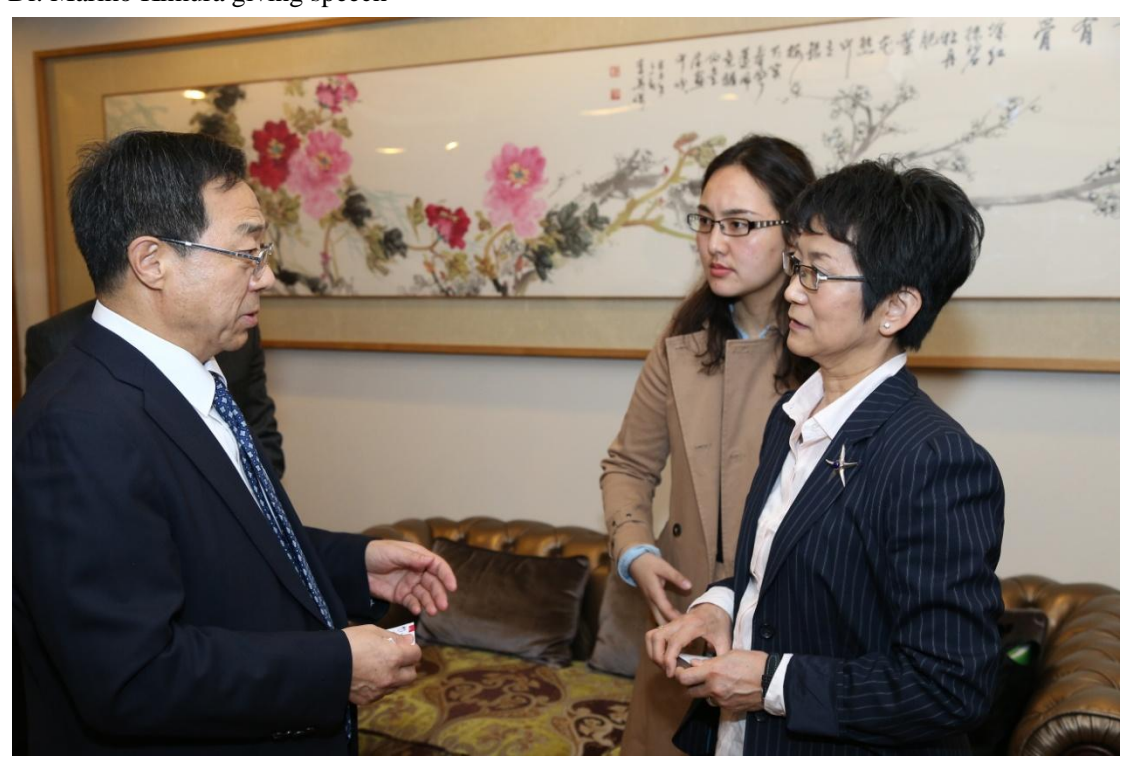
*President Kimura meeting the Vice Minister of the Ministry of Civil Affairs, PRC