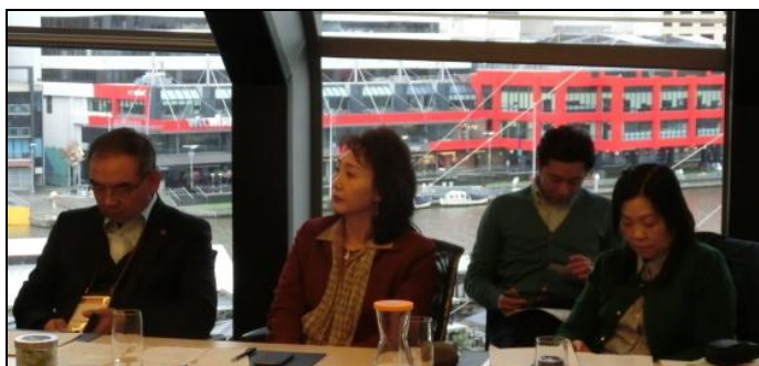
Other members @ IFSW-AP Regional Meeting

Suggestions for work to be undertaken in the future include strengthening the regional structure through developing some guidelines or standing orders to help clarify and support our regional committee.