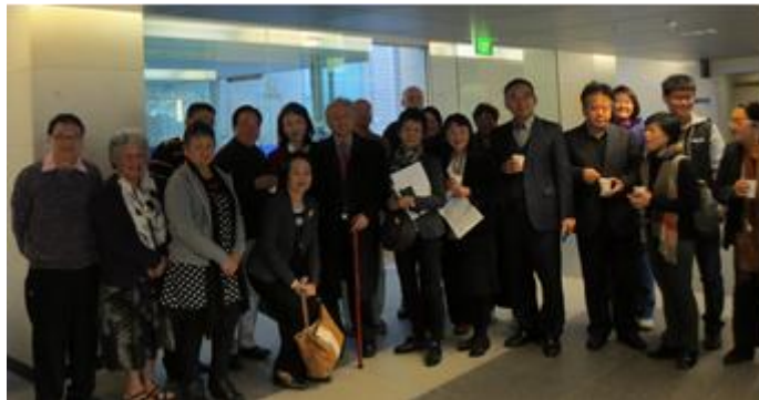
Group of IFSW-AP Members after the Regional Meeting

Our next meeting will be in Thailand in 2015.