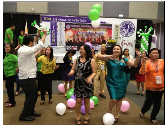
Happy Closing to PASWI Conference