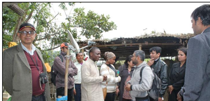
Sanitation awareness education in the Bardiya district of Nepal

We are very thankful and excited in becoming a member of IFSW. We are interested to link with social work organisations at different levels and collaborate to promote this profession for the establishment of a just and equitable society. SWAN is exploring hosting a social work and social development conference in 2016 in Nepal and is looking for other IFSW members who may be interested in either co-hosting or supporting such an event.