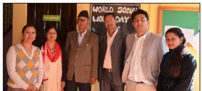
Founding Members of SWAN

SWAN is a national professional association representing social workers in Nepal, and established on June 29, 2014. It is also a member organisation of the International Federation of Social Workers (IFSW). It is a new organisation which signifies a major step forward for social work at the national level. Education in social service was available in early 1990 in Nepal, but the concept of professional social work education at Bachelor's degree level was started in late 1996 by some of the professional social workers. Professional social workers have realised that education in this profession is vital for improvement of social, economic, psychological and spiritual well-being of the deprived and marginalised individuals and communities. Quality education and practice, lack of understanding and recognition of social work as profession, lack of well qualified human resources in different fields of specialised areas, are the challenges of social work education in Nepal. The quality of social services in the human service organisations is also ineffective.