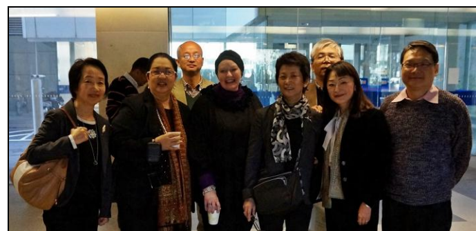
IFSW-AP Members @ IFSW General Meeting, Melbourne University