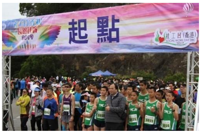
The Long Run

Echoing the theme of 2017 "Promoting Community and Environmental Sustainability", seminar а on "Sustainable Development and Diversified Practice" was held on 21 March 2017. Insights of scholars gave a conceptual framework on the topic, added by practical experiences of social workers and sharing of service users. The event drew more than 150 participants from over 30 agencies, including frontline workers, social work teachers and students. The open forum after the presentations provided a platform for discussions and exchange between the speakers and the floor.