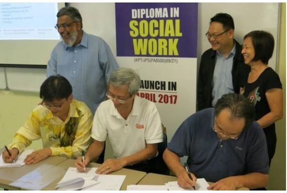
Representatives of the NGO Group of 5 sign on

students. This is another milestone for MASW and for social work in Malaysia, and a historical development for the first private college to run a social work education programme in English in Malaysia.