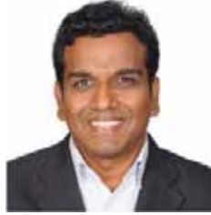
Adv. David Sun- derraj, Madras High Court

KAPS Kozhikode Ch. in assn with KAPS HR & AHTC wing organized a webinar on 'Human rights protection of vulnerable groups in india' on 5 Dec 2020.