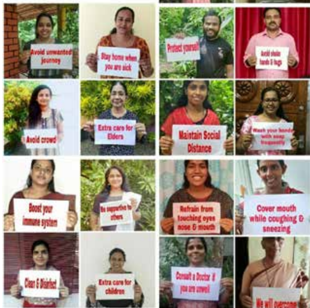
Kottayam Ch. elderly counselling team