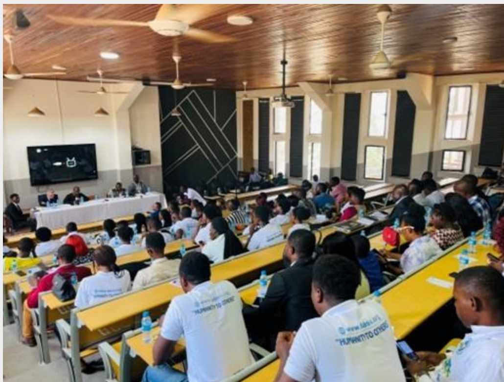
Photo: Cross Section of Participants at the National Social Work Conference 2024

The Sierra Leone Association of Social Workers (SLASW), in collaboration with the Ministry of Social Welfare; successfully concluded the National Social Work Conference 2024 on April 29th, 2024. Held at the esteemed Tunde Cole Auditorium on Fourah Bay College Campus in Freetown, the conference served as a pivotal platform for practitioners, educators, stakeholders, students from Social Work Societies of Fourah Bay College (FBC), Milton Margai Technical University (MMTU), Njala University (NU), University of Makeni (UNIMAK), Ernest Bai Koroma University of Science and Technology (EBKUST) and Eastern Technical University (ETU) and with support from UNICEF to engage in a profound dialogue centered on the theme: “A National Conversation on the Regulation of Social Work Practice, Education and Ethical Standards in Sierra Leone” .