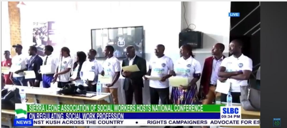
Photo: Cross-Section Newly Inducted members of the Sierra Leone Association of Social Workers (SLASW)